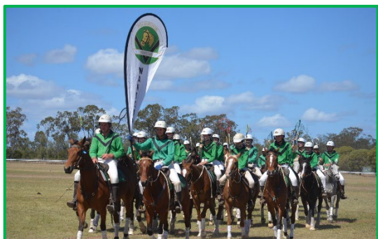
Wandoan in the March Past.

Some excellent horse flesh on show at the QPA State Champs.